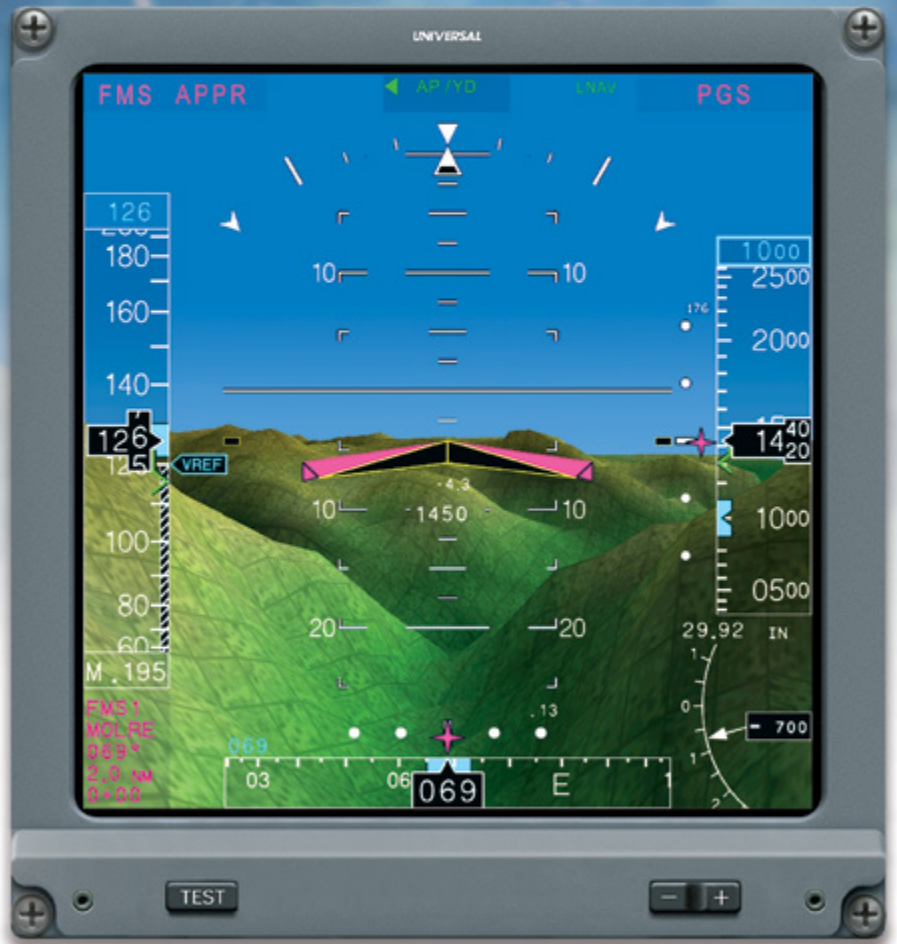
SVS Egocentric View shown on EFI-890R Primary Flight Display

Egocentric View (Pilot's View) Exocentric View (Wingman's View)