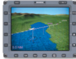
SVS Exocentric View displayed on an MFD-640 Multi-Function Display