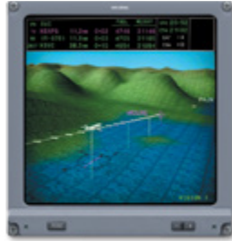
SVS Exocentric View displayed on an EFI-890R Navigation Display