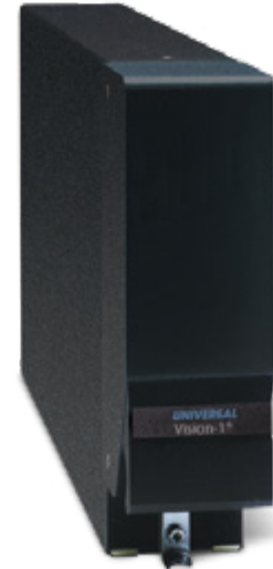
The terrain database is stored in solid-state memory within the Vision-1 computer, which is housed in a remote-mounted, 2-MCU sized Line Replaceable Unit (LRU).