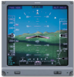
SVS Egocentric View displayed on an EFI-890R Primary Flight Display

A compass symbol, referenced to magnetic north, is displayed 1,000 feet directly below the aircraft. A magenta line depicts the FMS selected course and a black triangle for the aircraft heading.