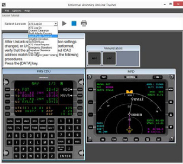
Send CPDLC messages of your own choosing.